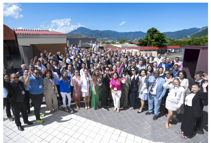
In June 2023 the place to be for the World Freight Network (WFN) members was Costa Rica. 2024 the reunion will be in Dubai.