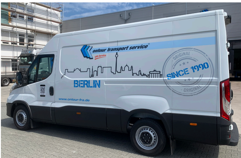
Left: Renewal in our bus fleet: A new Iveco Daily with Berlin branding replaces an old vehicle in order to always ensure our sustainability and quality standards in terms of vehicles.