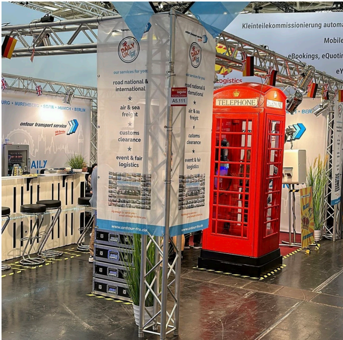
ontour at the transport logistics 2023. This year with a more open booth.