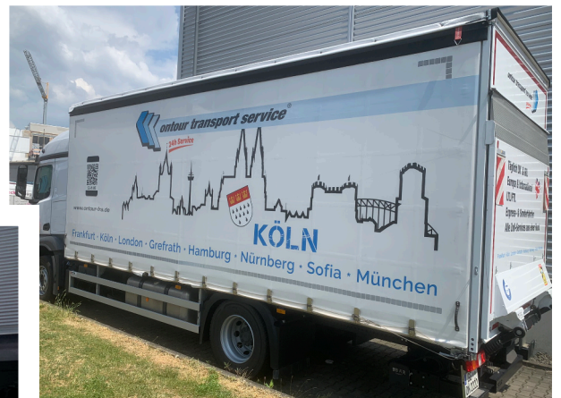
Right: New 18-tonne truck for Cologne - our colleagues in Cologne receive a new 18-tonne tarpaulin truck with tail lift.