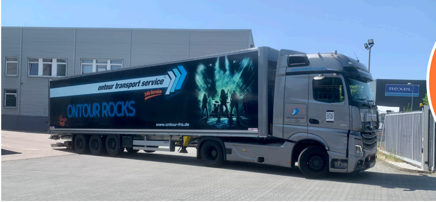
„ontour rocks“: Event- & fair logistics at its best. Whether it's a rock band, symphony orchestra, sport or fair event - we deliver your equipment punctually and reliably to its destination. With our new event trailer.