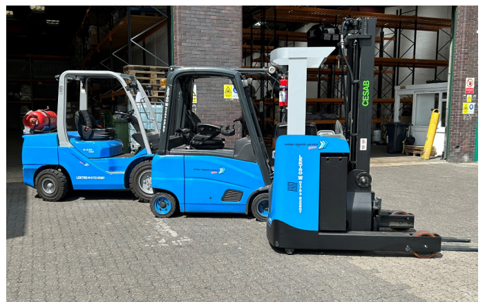
The forklift fleet of ontour logistics services UK Ltd.: Up to any task.

And is opting for blue. But that is only the colour aspect to keep with the corporate design. The most important thing of course is that our London colleagues have access to a modern fleet of forklifts that can meet any requirements with a lifting capacity of up to 3,500 kg and manoeuvrability in the narrowest of racking aisles. And at the same time, with the latest safety aspects, it enables our warehouse team in the UK to work safely.