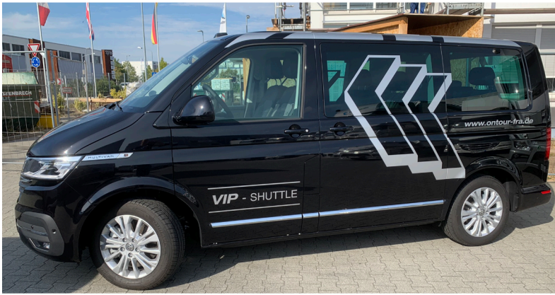
„VIP Shuttle“: A new VW T6 with top vehicle equipment replaces our old team transporter and also received a design relaunch in black/silver.